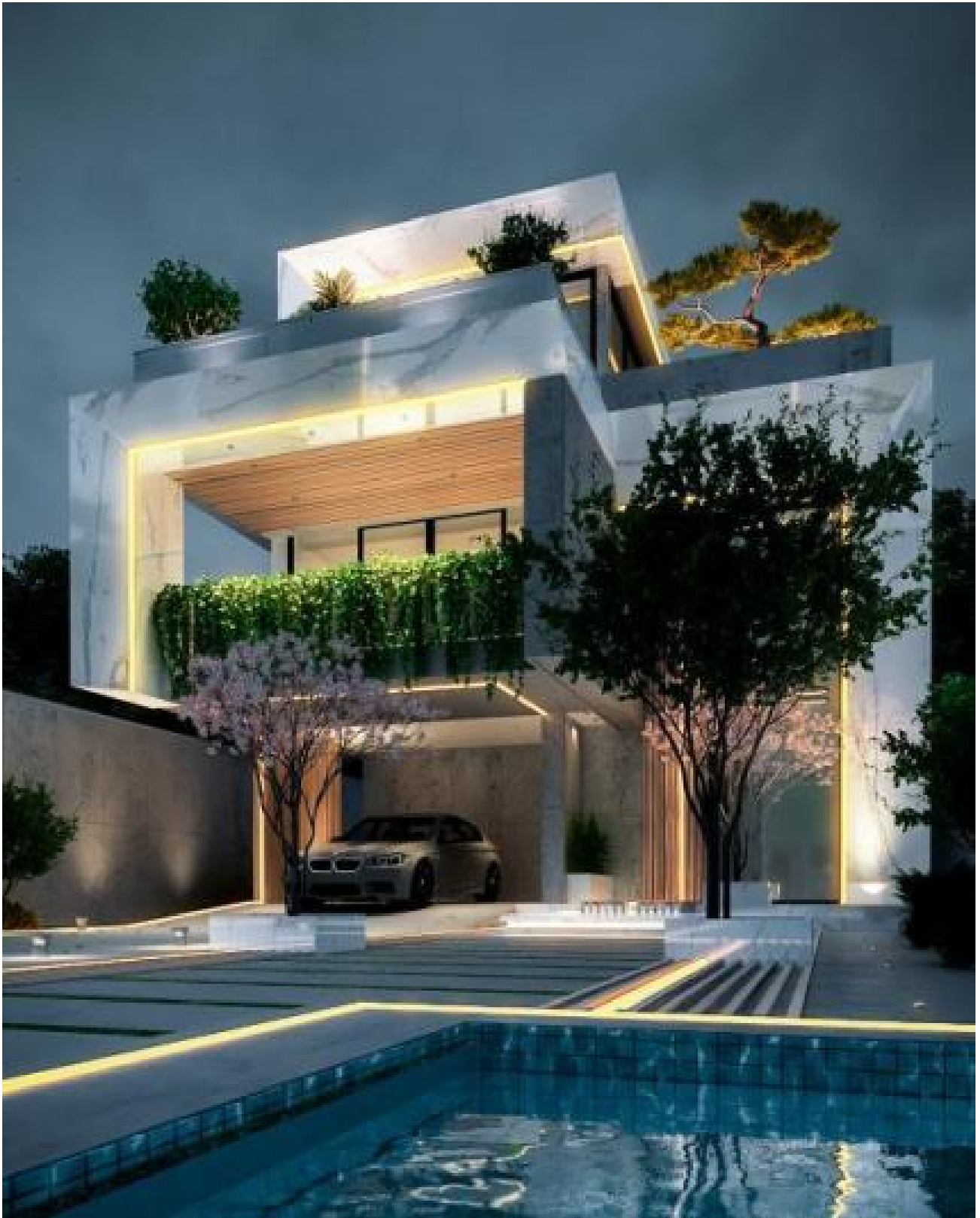
Maple Court Unit