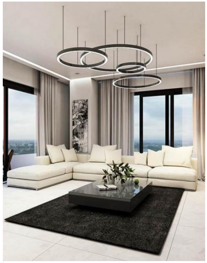
2 BEDROOM APARTMENT FOR SALE IN AIRPORT RESIDENTIAL ACCRA