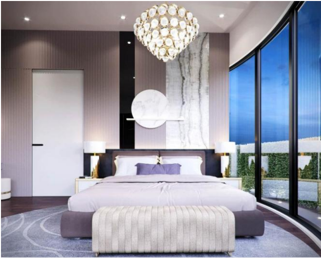
2 BEDROOM APARTMENT FOR SALE AT AIRPORT RESIDENTIAL AREA