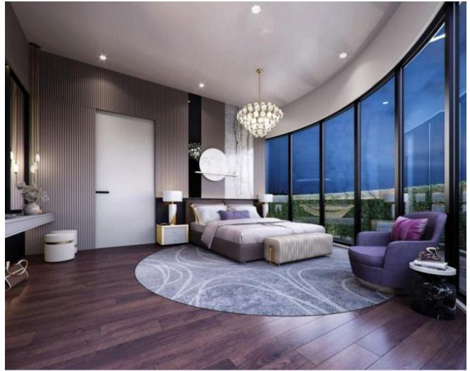
3 BEDROOM APARTMENT FOR SALE AT AIRPORT RESIDENTIAL AREA